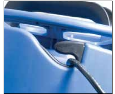
Power Cable Soft Guide

Both models in the blue range incorporate our high performance TwinFlo, two-stage vacuum motor turbine linked to our AutoSave energy conservation system, allowing the machine to operate automatically at the 600W Eco setting or, equally, at the 1200W high performance standard as required.