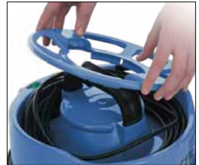
Clever Release Cable Tidy System