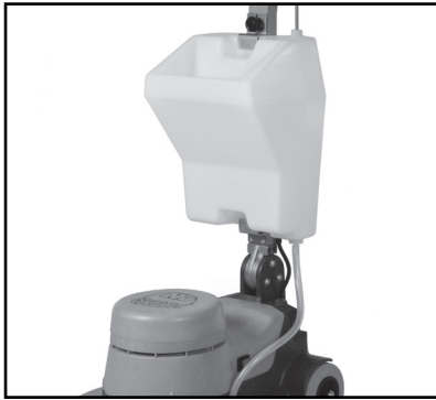
Optional Water Tank