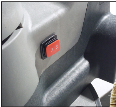
2 Speed Switch