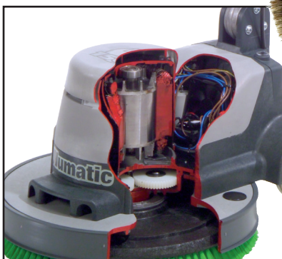
High Torque 1500W Motor