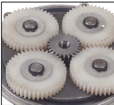
Sealed Planetary Gearbox