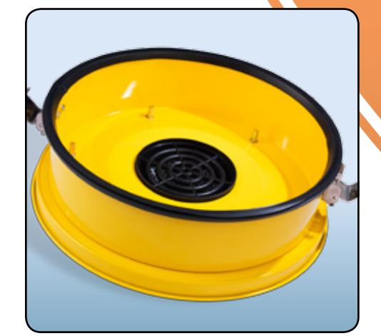
HEPA enclosed filtration module