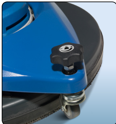
Simple load adjustment