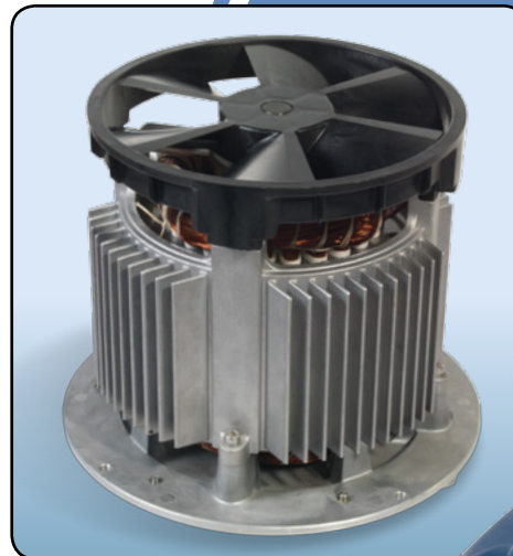
Hurricane Hi-Cool heavy duty motor technology